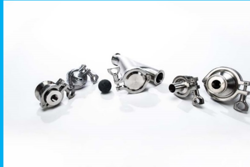
Air Blow, Y-Ball, Check Valve

Sanitary Solutions stocks T316L, 1.5"—6.00" Air Blow Check Valves with either the 3/8" Air Line Coupler, 1/2" Female NPT or rubber hose barb connection.